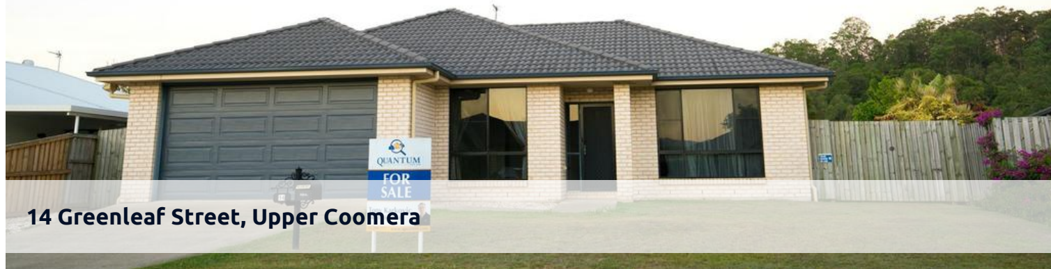
14 Greenleaf Street, Upper Coomera