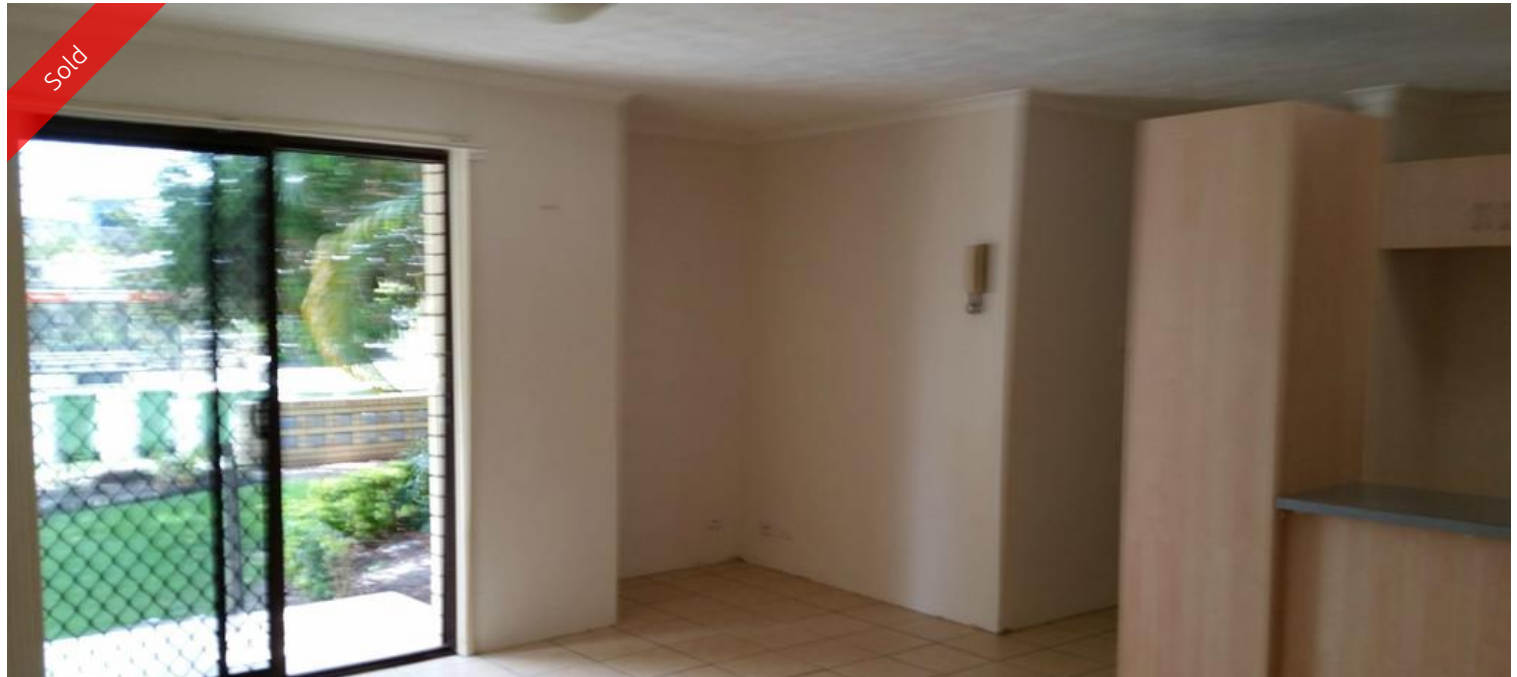
Unit 1, 25 Ahern Street, Labrador