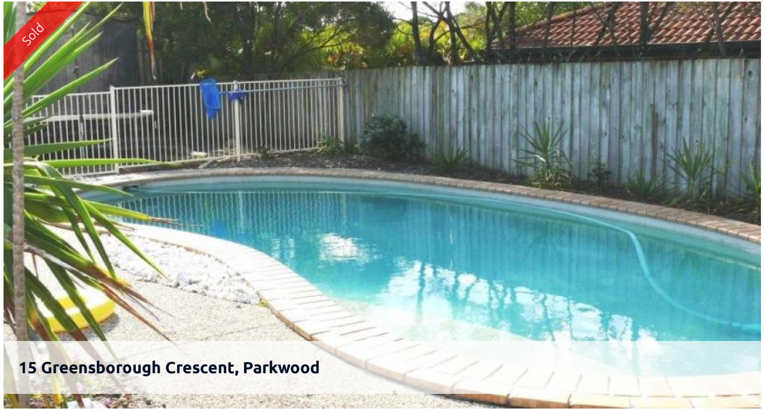
15 Greensborough Crescent, Parkwood